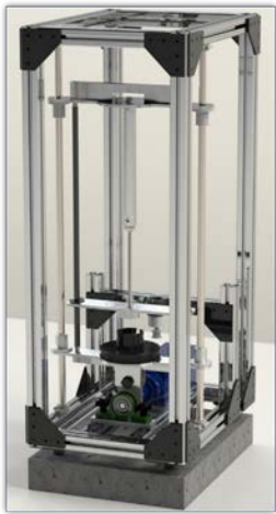
Completed Compaction Station

Autoliv produces 43% of the world's airbags. An inflator module in each airbag fills the bag with gas by igniting the enclosed generant tablets. It is critical to consistently package these tablets in order to ensure proper airbag function.